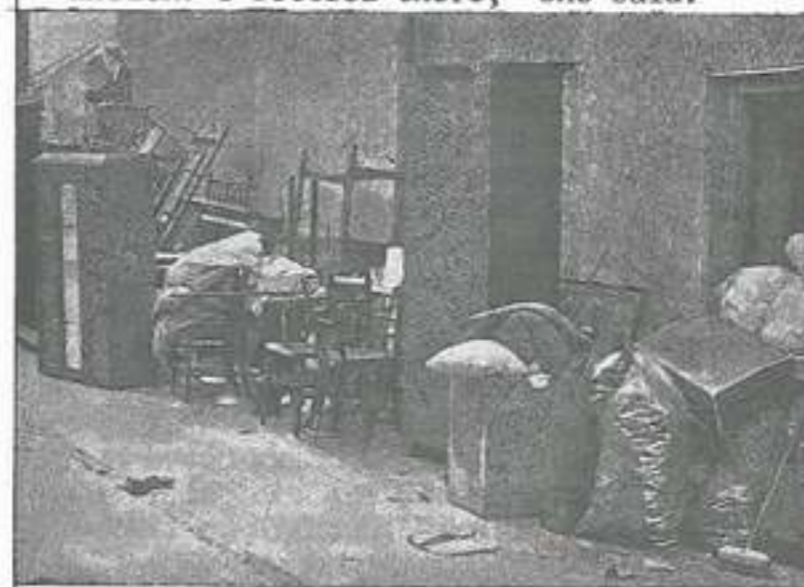
Tenants' belongings stacked in a laneway

Born in Monaghan, she had worked in hotels. 'I came to Kilkee over twelve years ago. After the holiday season my job and my money ran out and I came to Limerick. I settled there,' she said.